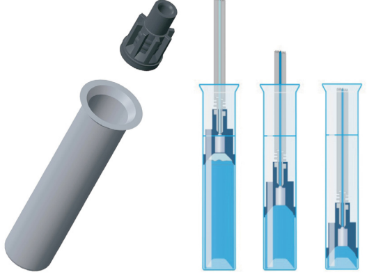
Figure 2. Autosampler sample displacement filtration.

Sample vial filter caps<sup>3</sup> (plunger caps with an integral filter) are installed in the top of an inert sample vial. The autosampler arm applies a sampling tube which forms a seal with the filter cap and pushes the cap into the vial, displacing the sample upwards through the filter and into the IC system (Figure 2).