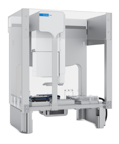
The Agilent Bravo has nine deck positions and can be configured with interchangeable 96-, or 384 disposable tip heads.