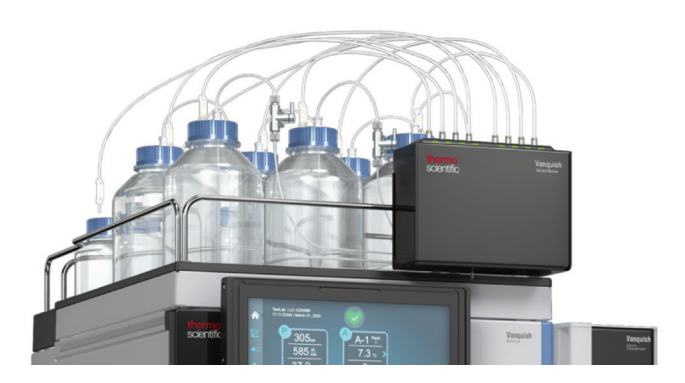
Figure 1. A Vanquish UHPLC system equipped with the Vanquish Solvent Monitor – 8 channel version

The Thermo Scientific™ Vanquish™ Solvent Monitor utilizes individual sensors for each solvent channel on Vanquish HPLC and UHPLC systems to measure the live consumption of each mobile phase and accumulation of waste. There are two models available: a basic 4-channel version and an 8-channel version for advanced monitoring capability. The device is based on a patented technology that uses hydrostatic pressure measurements to accurately determine the remaining liquid in a solvent bottle or the empty volume in a waste reservoir. The Vanquish Solvent Monitor integrates an intelligent, self-calibrating algorithm for increased precision; it does not require any manual interaction or reference settings and is completely independent of the mobile phase type or composition.