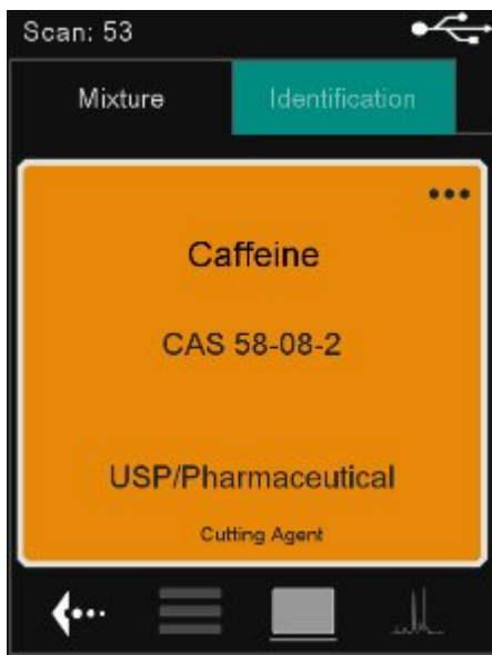
Figure 2. Actual screenshot of identification of caffeine in Yaba with MIRA DS. Caffeine is a chemical commonly associated with illicit drugs. The yellow warning background provides immediate, actionable information about the nature of the sample.