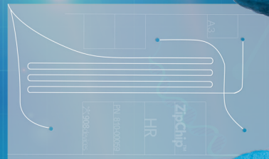
ZipChip system hardware for Orbitrap technology