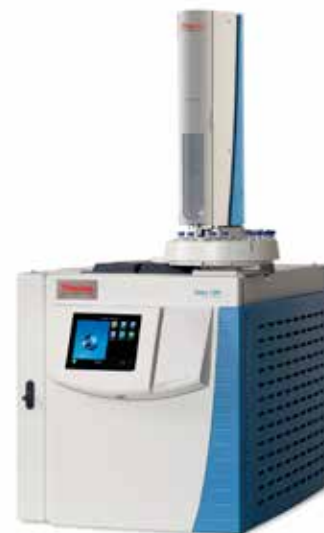
TRACE 1310 GC

In this laboratory, the average workload for GC analyses is between 500 and 700 batches per year. For this, they have many GC systems in the lab to compare with, including several Thermo Scientific systems.