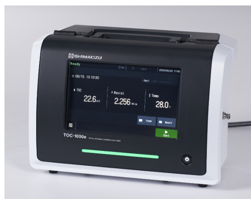
Fig. 1 TOC-1000e