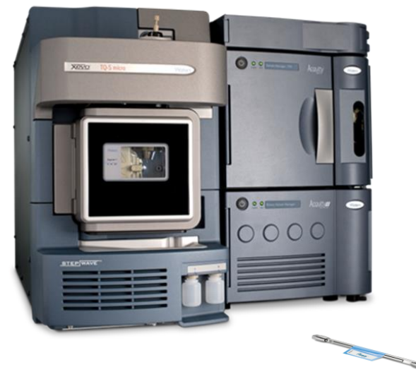
Figure 2: Xevo TQ S Micro with Acquity UPLC H-Class Plus , Atlantis™ Premier BEH C18 AX 100 mm X 2.1 mm, 2.5 μm column

RADAR mode rapidly switches between MRM (MS/MS) mode and MS full scan acquisition which enables the analyst to monitor for matrix interferences, placebo, impurities and degradants in a sample while accurately quantifying target compounds without losing sensitivity or performance. Figure 1 shows a RADAR scan investigation results where API is clearly separated from the NDSRI and eluting later. Diverting the API peak to waste, avoided the contamination of the mass spectrometer increasing the method robustness.