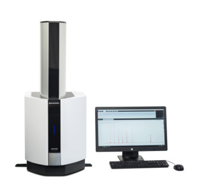
Fig. 1 Shimadzu MALDI-8020 benchtop linear MALDI-TOF instrument