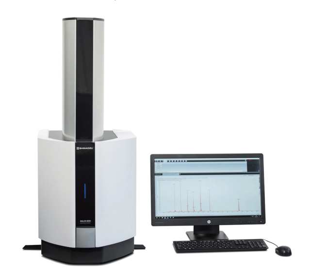
Fig. 1 Benchtop MALDI-TOF MS: MALDI-8020

Fig. 2 shows the amino acid sequence of Ribonuclease B. It is known that due to the N-linked glycosylation of the high mannose type, this protein is detected with its main component being a modification approx. 1217 greater than its intrinsic mass. Bovine derived ribonuclease B (5 pmol) was mixed with ferulic acid (10 mg/mL, 50 % acetonitrile/0.1 % formic acid solution), and analyzed in linear mode using MALDI-8020. The result is shown in Fig. 3. The singly-charged protonated molecule of the detected ribonuclease B is detected at m/z 14890, which is consistent with the theoretical value (14899.3). In addition, the distribution due to heterogeneous sugar chains is detected as a mass difference (theoretical value: 162) derived from hexose. As indicated above, the resolving power, mass accuracy, etc., of the linear mode of the MALDI-8020 are comparable to those of a larger conventional MALDI-TOF mass spectrometer in the same mode.