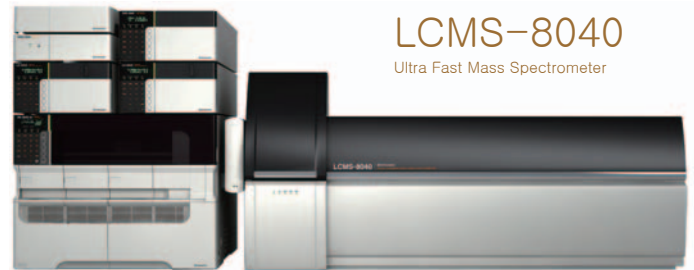
Fig. 1 LCMS-8040 Triple Quadrupole Mass Spectrometer