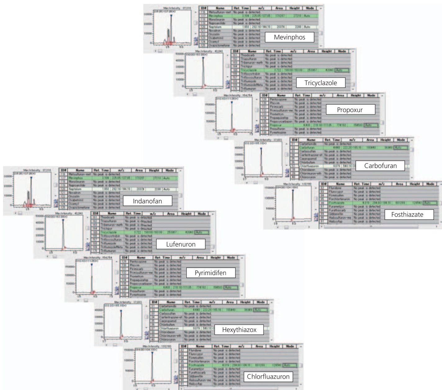
Fig. 3 Result of automatic identification (10 ppb spiked in the green tea leaves)