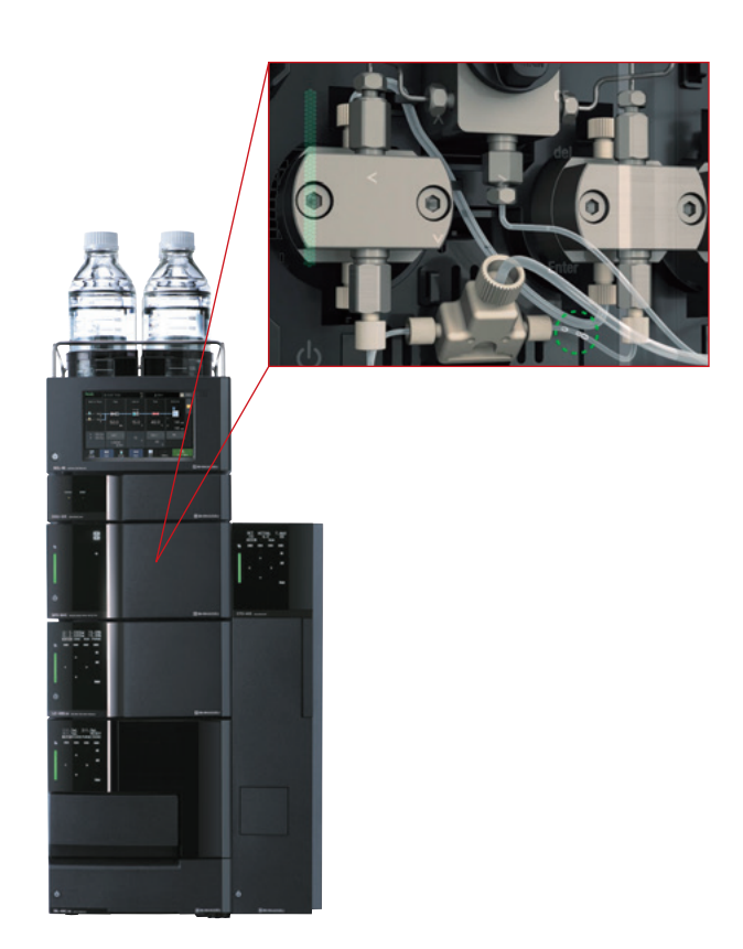
Fig. 1 Diagram of the Nexera<sup>™</sup> solvent delivery unit flow lines

Auto-diagnostics and auto-recovery functions prevent data loss and waste of samples by automatically detecting abnormal pressure variations triggered by air bubbles within the system and performing corrective actions such as flow line purging until the system regains normal operational status (Fig. 2).