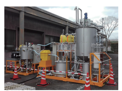
Fig. 2 Transportable Methane Fermentation Pilot Plant

IRI Shizuoka Pref. is developing a high-efficient and low-cost methane fermentation plant for small-scale food processing companies. In early 2017, a transportable methane fermentation pilot plant with a 1,000 L fermentation tank shown in Fig. 2 was developed by industry-academia-government collaboration team. Starting from 2017, the team sets up the pilot plant at various kinds of food processing factories to verify fermentation performance and cost efficiency of each food waste. The test results will be disclosed as model case to encourage other food processing companies to adopt methane fermentation plant in the prefectural area.