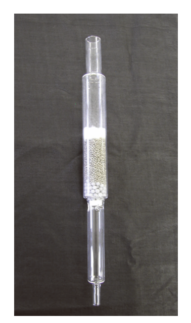
Fig. 1 High-Salt Sample Combustion Tube

Fig. 1 shows a high-salt sample combustion tube. Compared to the standard combustion tube, it has a larger diameter, and also, because a portion of the catalyst used consists of particles of greater diameter, it serves to alleviate the clogging of salts. Also, sulfuric acid is used for acidification when conducting NPOC measurement, so sulfate salt is accumulated in the combustion tube, which reduces the frequency of combustion tube replacement. Thus, in the case of seawater samples, up to 2500 measurements can be conducted without the need for maintenance (using 40 \mu L injection volume).