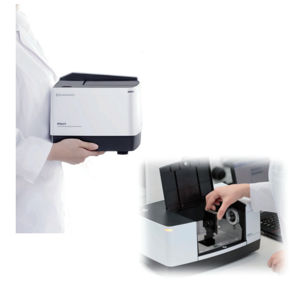
Fig. 1 External Appearance of IRSpirit™

An IRSpirit<sup>TM</sup> Fourier transform infrared (FTIR) spectrophotometer was used. Fig. 1 shows the external appearance of the instrument. The IRSpirit has a small, portable body with dimensions of 390(W) \times 250(D) \times 210(H) mm, which is smaller than A3 size. For installation where space is limited, its unique design enables access from both sides. It features both best-in-class SN ratios and resolution and has high expandability, with the widest sample compartment in its class, which can accommodate both Shimadzu accessories and third-party accessories. Since it also has functions specifically designed for contaminant analysis, including contaminant analysis programs and contaminant libraries, it can be used in various applications, not limited to identification testing.