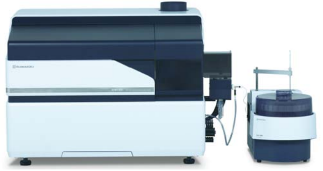
Figure 1. ICPMS-2030 Inductively coupled plasma mass spectrometer with AS-10.

A Shimadzu ICPMS-2030 coupled with auto sampler AS-10 (Figure 1) was used. The detailed instrument configurations and operating parameters are summarized in Table 5.