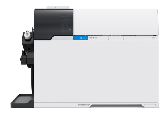
Figure 1. Compact, cleanroom-ready, benchtop Agilent 7900s ICP-MS provides high sensitivity and flexible modes for interference control.

Agilent has also continued to refine and improve conventional (single quadrupole) ICP-MS instruments. The semiconductor configuration Agilent 7900s ICP-MS is ideally suited to the analysis of typical semiconductor process chemicals where the ultimate performance of the Agilent 8900 ICP-QQQ is not required, as illustrated overleaf.