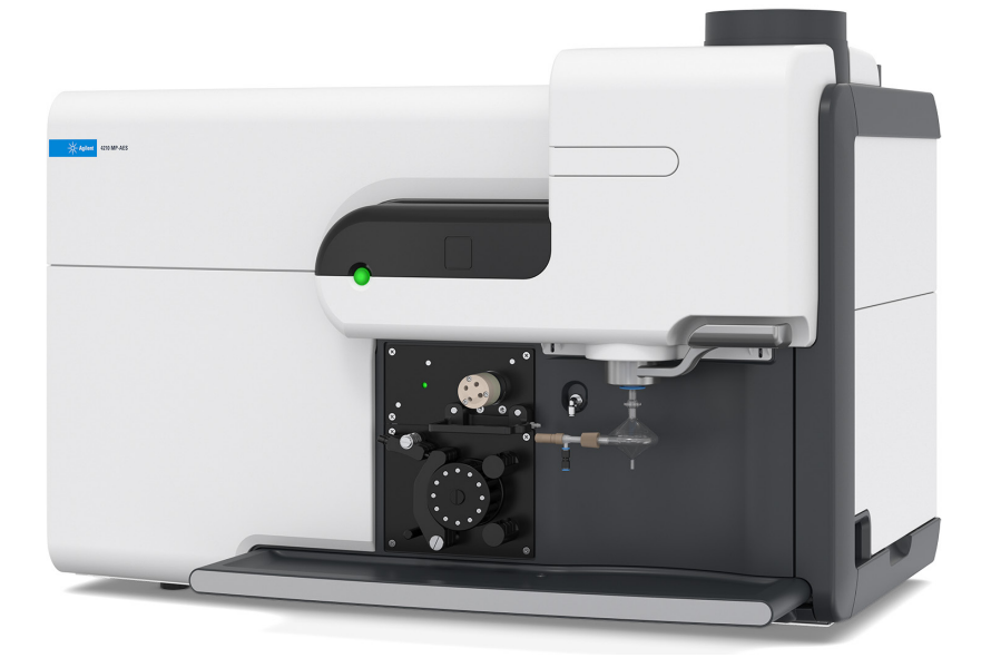
The 4210 MP-AES uses only nitrogen as a fuel, eliminating combustible gas usage and gas transportation. With minimal standby power consumption you can use less gas and electricity, compared to comparable techniques for crude and residual fuel analysis.