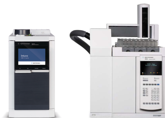
Agilent Intuvo 9000 GC and Agilent 7697A headspace sampler.

For more information, visit: www.agilent.com