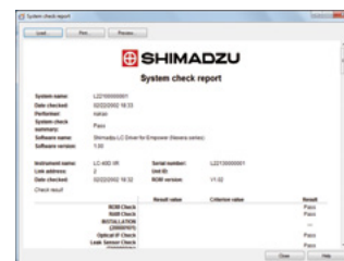
System Check Report