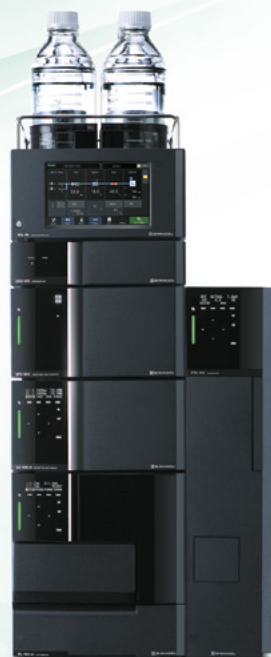
Nexera series Ultra High Performance Liquid Chromatograph

Shimadzu's LC/GC driver software is designed for customers that are considering multi-vendor support for Empower software. It provides the optimal environment for operating LC and GC systems, including the latest by enabling instrument control, sample analysis, data analysis, report output, and other operations using Empower software.