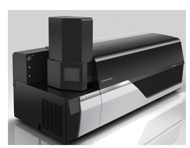
Fig. 1 DPiMS™-8060