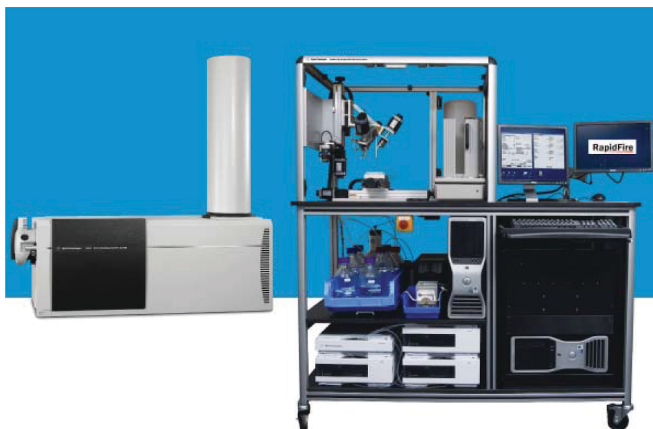
Figure 1. Agilent RapidFire High-Throughput System.

The RapidFire 360-MS system consisted of the following modules: