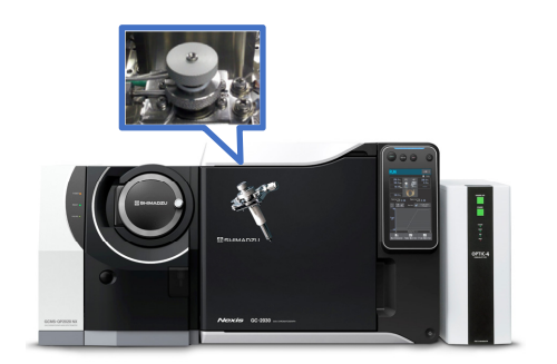
Fig. 1 GCMS-QP<sup>™</sup>2020 NX + OPTIC-4