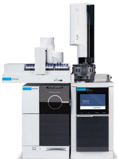
Agilent 5977B GC/MSD system