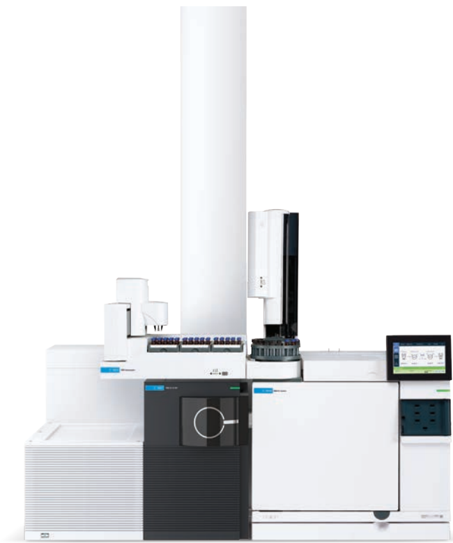
Agilent 7250 Agilent 7250 GC/Q-TOF system