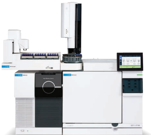
Agilent 7010B triple quadrupole GC/MS system

Identify unknown compounds and uncover additional data using the unique capabilities of our quadrupole time-of-flight GC/MS system, with its low energy capable electron ionization (EI) source. This revolutionary all-in-one system is ideal for performing complex metabolomics studies, screening for pesticides in challenging matrices, identifying analytes in herbal extracts, monitoring contaminant levels in fuel, and more.