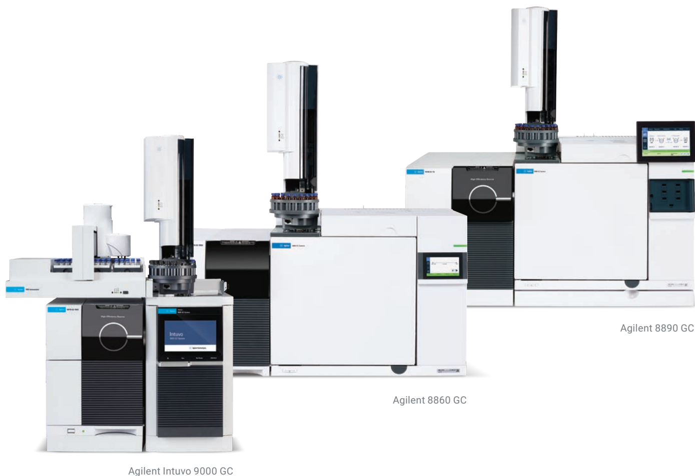
Agilent Intuvo 9000 GC

You can't go wrong with a GC/MS instrument from Agilent. We start with the world's most trusted gas chromatographs. Our latest models are super smart: they tell you when to change a column, let you know if there's a leak, and collect system information to help you be more productive. Then we pair those GCs with quadrupole, triple quadrupole, and time-of-flight mass spectrometers—so you can choose the technique that best suits your needs. Whether you're doing routine testing or cutting-edge research, we have a system for that. And we have lots of ways to accelerate your turnaround time.