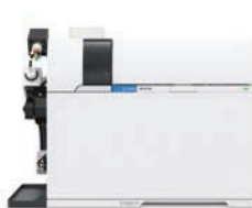
Agilent 7800 ICP-MS system