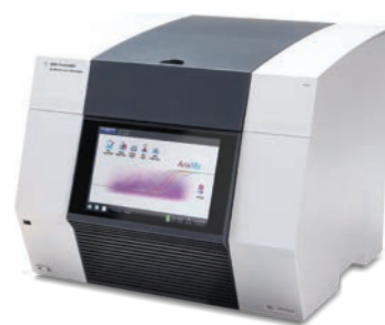
Agilent AriaMx Real-time PCR system

a validated workflow that includes decontamination, an internal control, and multiplexed reactions. In multiple states in the U.S. and in Canada, this workflow was used to test up to 46 samples at a time for Salmonella , Shiga toxin-producing E. coli , mold, and four Aspergillus species in one 96-well plate.