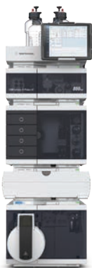
Agilent 1260 Infinity II Prime LC with Ultivo LC/TQ