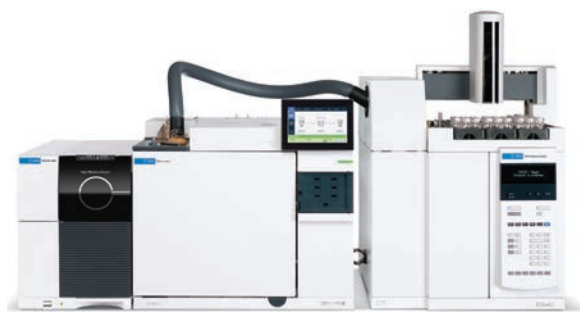
Agilent 8890/5977B GC/MSD with 7697A headspace sampler Headspace sampling ensures an inert sample pathway for superior GC/MSD performance without analyte degradation or loss.

Our certified pre-owned instruments deliver like-new performance, reliability, and speed at an affordable price. Agilent-trained technicians refurbish each instrument using genuine Agilent factory parts, so you can be sure that each module meets our rigorous specifications. And every instrument comes with the Agilent 12-month warranty for ultimate peace of mind.