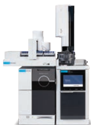
Agilent 7010B triple quadrupole with Intuvo 9000 GC/MS