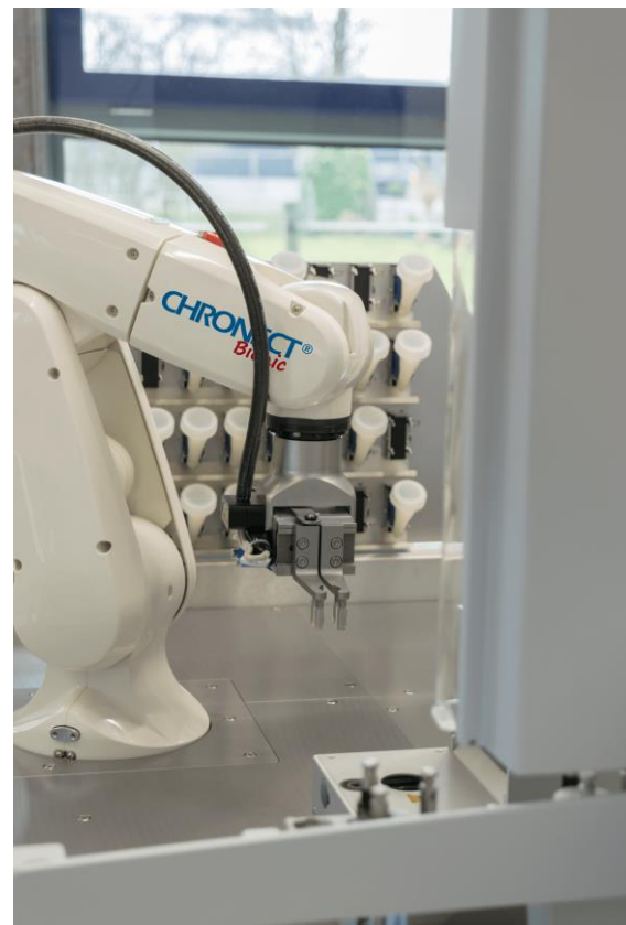
Figure 3: CHRONECT Bionic as industrial robot for extra-fast application.