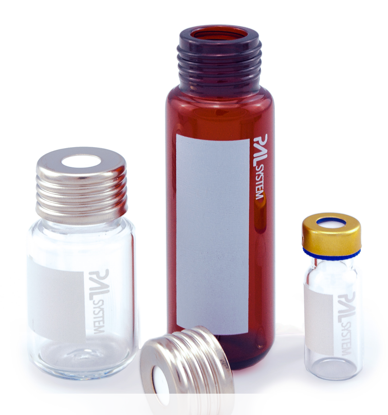
Consumables - Vials, Vial Caps and Seals