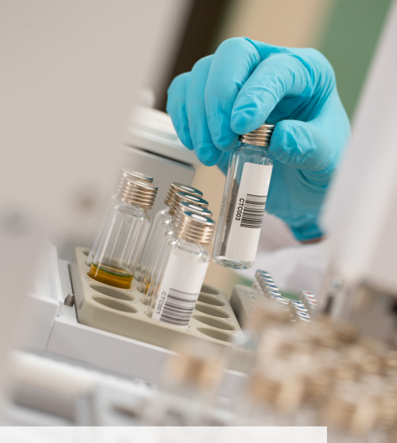
Tray Holders, Stacks and Racks