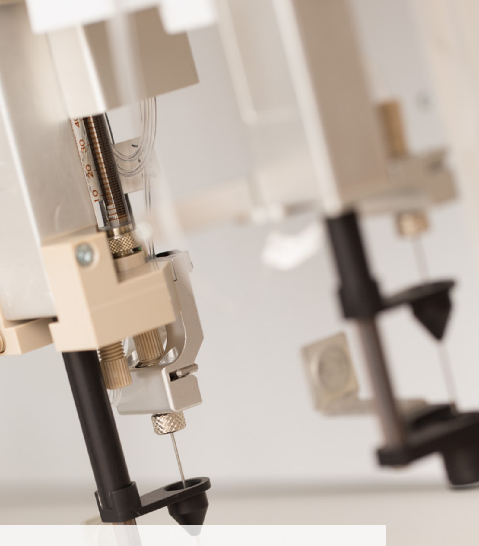
Tools & Syringes