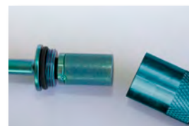
Silonite™ Filter Inlet Kit w/ Rain Guard – PN: 39-92204S