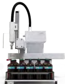
7650-L20 GC Gas Autosampler