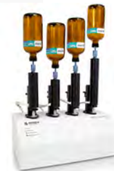
5400B Thermal Transfer System