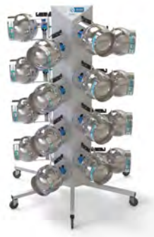
7016D Canister Autosampler