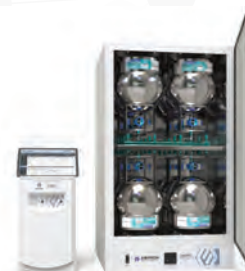
3108D Canister Cleaning System

The Recognized Global Leaders in Environmental Air Analysis.