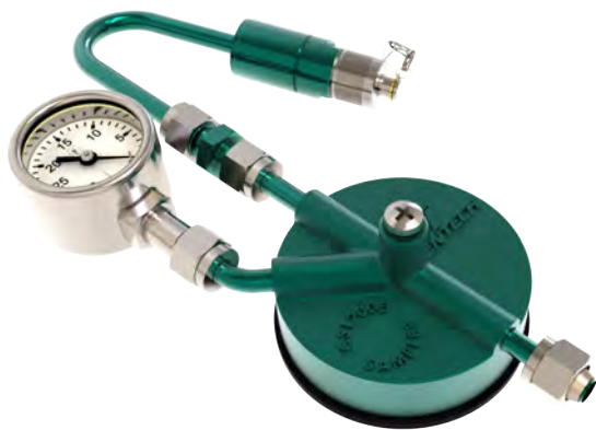
CS1200ES Silonite™ Coated Passive Canister Sampler