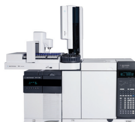
Agilent 5977A GC/MSD