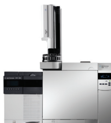
Agilent 5977E GC/MSD

To learn more about the Agilent 7000C Triple Quadrupole GC/MS, visit www.agilent.com/chem/7000C