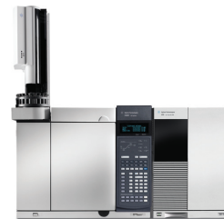
Agilent 240 Ion Trap GC/MS

This information is subject to change without notice.