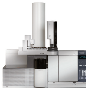
Agilent 7200 Q-TOF GC/MS