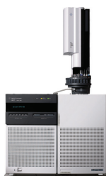
Agilent 5975T LTM GC/MSD