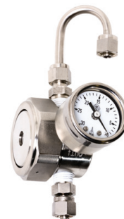
Miniature Air Sampling Kit