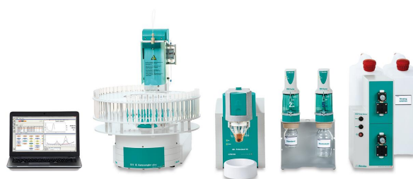
Figure 1. 884 Professional VA, fully automated for voltammetric analysis.

The scTRACE Gold is electrochemically activated prior to the first determination.