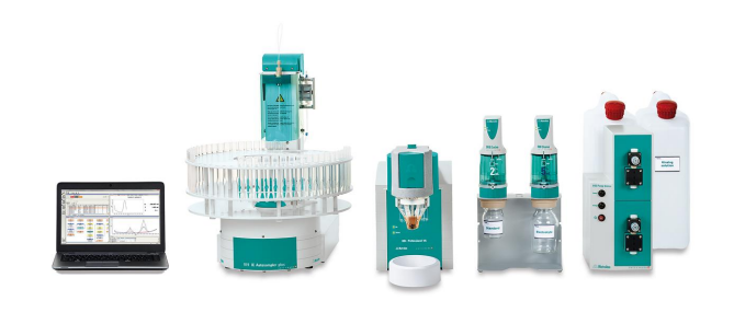
Figure 1. 884 Professional VA, fully automated for VA analysis.

The scTRACE Gold is electrochemically activated prior to the first determination.