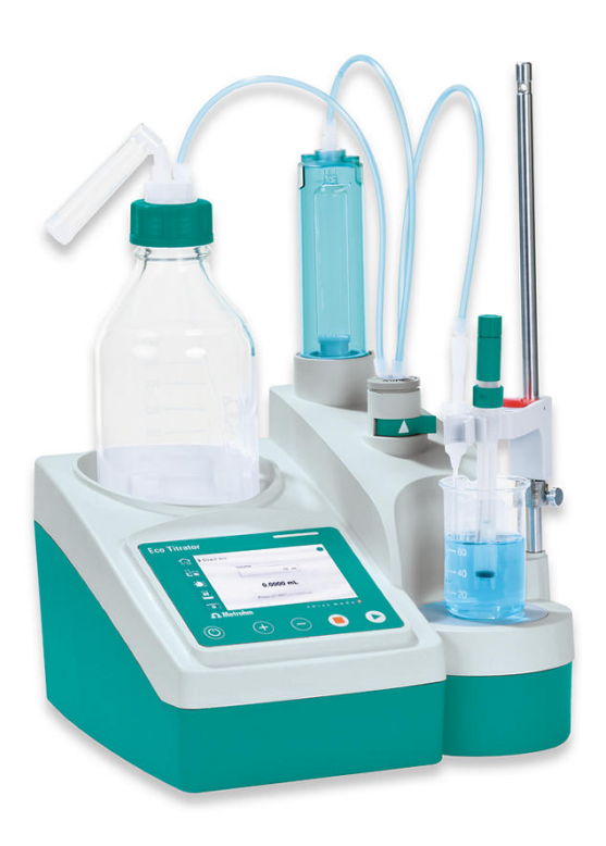
Figure 1. Eco Titrator equipped with a Solvotrode easyClean with integrated Pt1000 temperature sensor.

integrated Pt1000 temperature sensor (Figure 1).