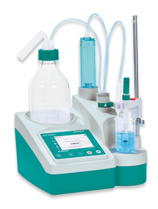
Figure 1. Eco Titrator equipped with a Unitrode with integrated Pt1000.

An appropriate amount of sample is pipetted into the titration beaker and then deionized water and sodium chloride are added. Afterwards, the solution is titrated until after the third endpoint with standardized sodium hydroxide.