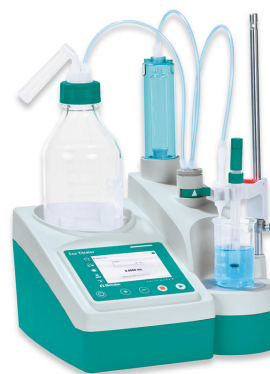
Figure 1. The Eco Titrator from Metrohm equipped with a Unitrode with integrated Pt1000.

An appropriate amount of sample is pipetted into the titration beaker, then deionized water is added. Afterwards, the solution is titrated until after the first endpoint with standardized sodium hydroxide.