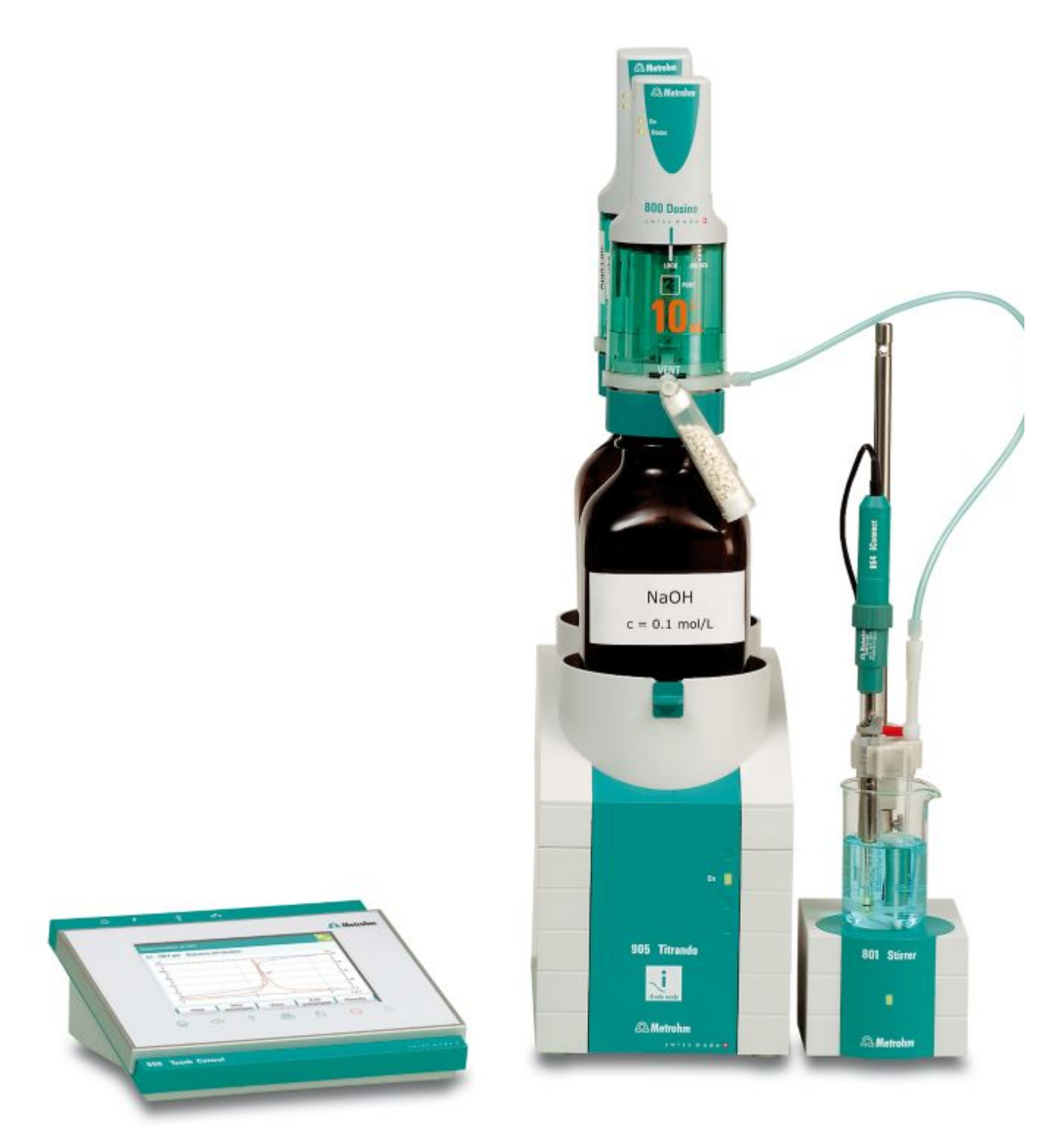
Figure 1. Example of a Titrando system consisting of a 905 Titrando and a 900 Touch Control. Alternatively the 905 Titrando can also be connected to a PC and controlled by tiamo.

The analysis is performed automatically on a Titrando system consisting of a 905 Titrando. The Unitrode is used for the indication of the titration curve.