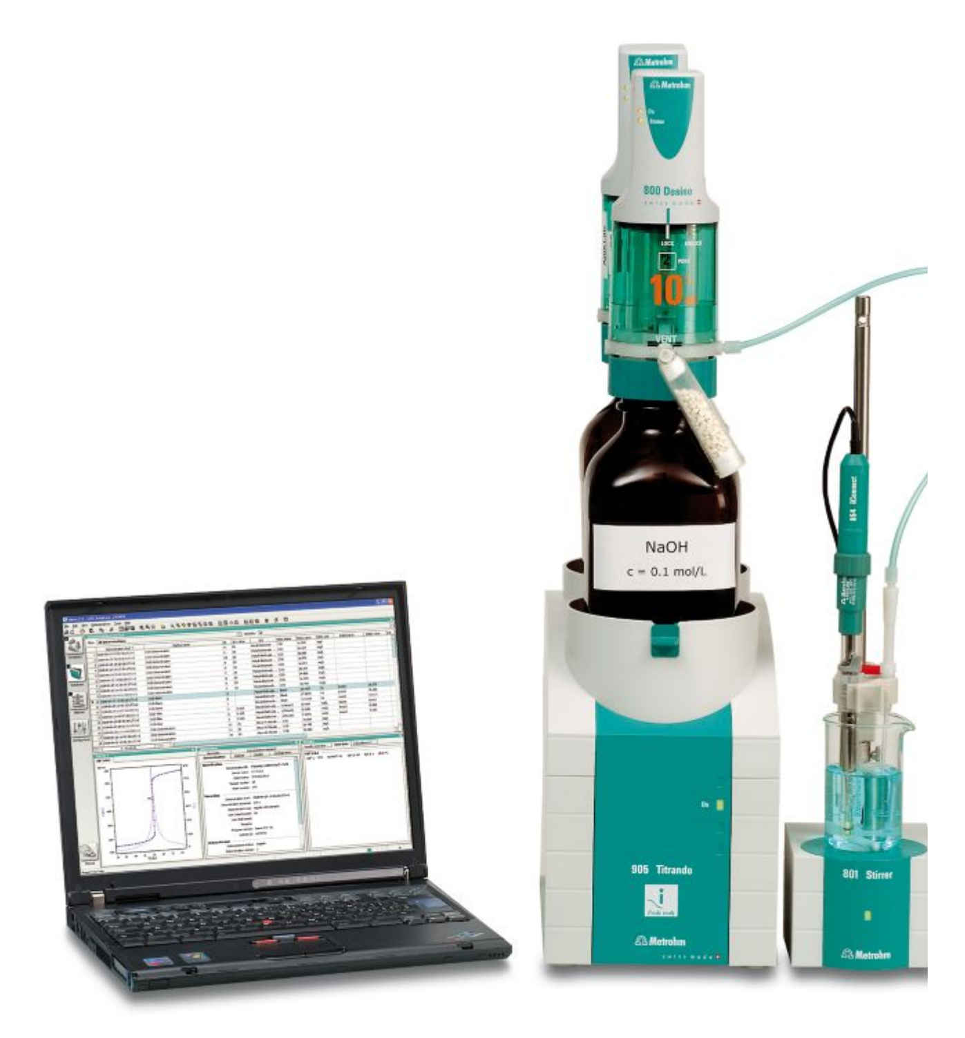
Figure 1. 905 Titrando with tiamo. Example setup for the analysis of lithium in brine.

The analysis is carried out with an automated system consisting of tiamo <sup>TM</sup> in combination with a 905 Titrando. A fluoride ion selective electrode (ISE) in combination with a Long Life ISE reference electrode is used for the indication of the titration.