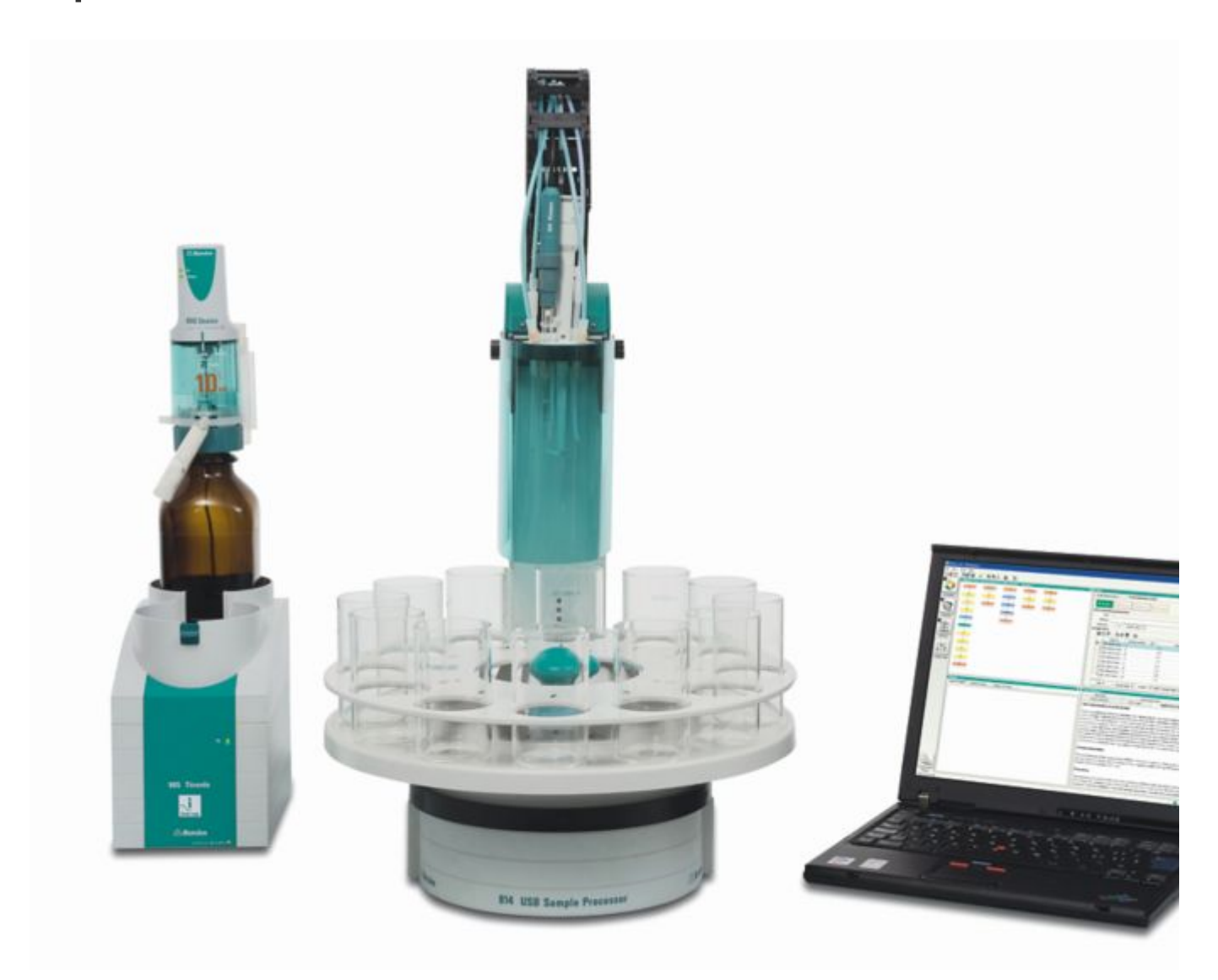
Figure 1. Titrando system consisting of an 814 USB Sample Changer in combination with a 907 Titrando and tiamo.