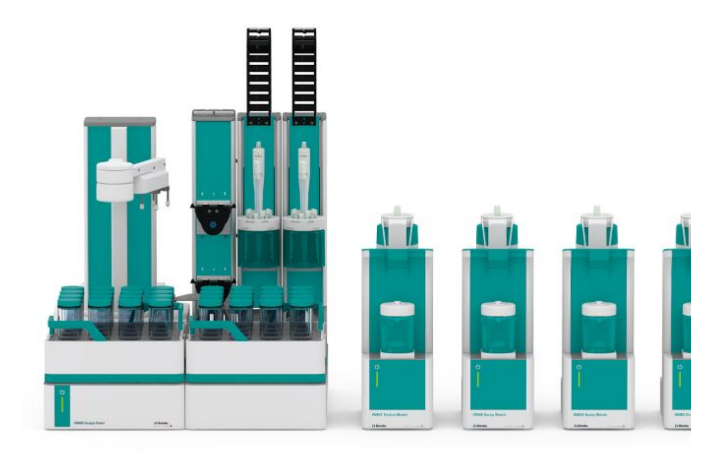
Figure 1. Example of an OMNIS system consisting of an OMNIS Sample Robot S with two working stations, an OMNIS Professional Titrator, and a corresponding amount of OMNIS Dosing Modules to add all necessary solutions.

The analysis is carried out automatically on an OMNIS system consisting of an OMNIS Sample Robot S and an OMNIS Titrator. The maintenance-free dPt Titrode is used for indication of the equivalence point.