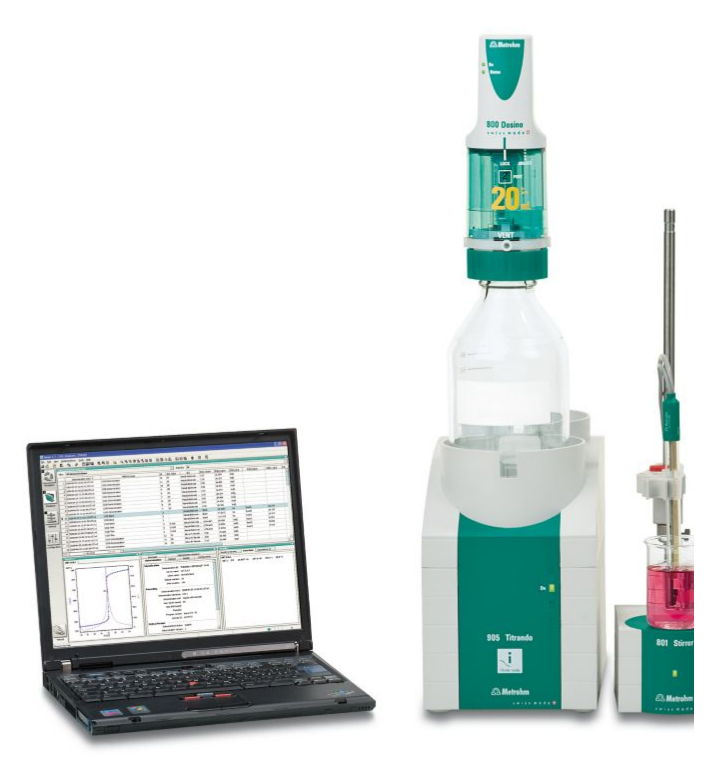
Figure 1. Titrando system consisting of a 905 Titrando, an Optrode, and tiamo for data processing.

The analysis is carried out fully automatically on a Titrando system consisting of a 905 Titrando and an Optrode ( Figure 1 ).