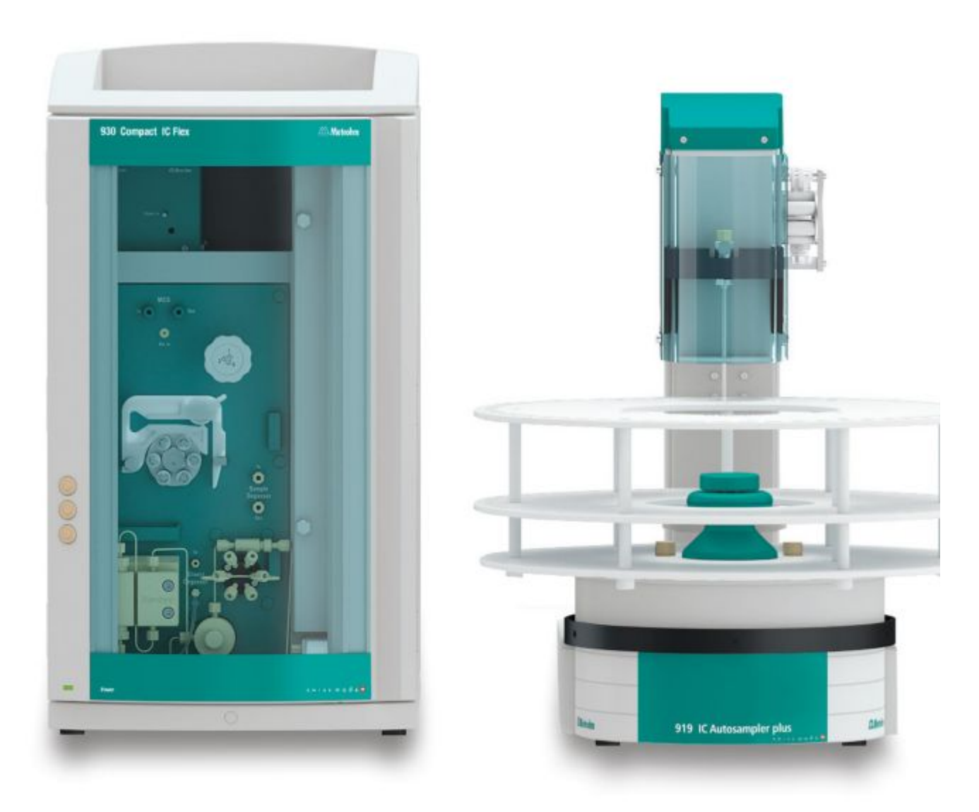
Figure 1 Instrumental setup including a 930 Compact IC Flex with IC Conductivity Detector (L) and the 919 IC Autosampler plus (R).

The samples were injected directly into the ion chromatograph ( Figure 1 ) and analyzed using the method parameters given in the respective USP monograph ( Table 1 ).