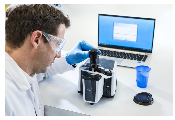
Figure 1. Agilent Cary 630 FTIR spectrometer coupled with a diamond attenuated total reflectance (ATR) module.

Fourier transform infrared (FTIR) spectroscopy is well-suited to the identification of different types of plastic, as it provides reliable performance, high-quality data, and cost-effective analyses. This study highlights how the Agilent Cary 630 FTIR spectrometer (Figure 1) provides a simple workflow that researchers can use for material identification of plastic debris. The workflow includes sample preparation, library generation, sample analysis, and data reporting.