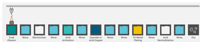
Figure 1. Illustration of a typical copper-tin-zinc (CTZ) alloy plating process flow. Extracted from [1].

Furthermore, the use of cyanide brings significant handling and safety concerns, as it is highly toxic and requires stringent safety protocols to prevent accidental exposure or environmental contamination [5]. Operators must take great care in storing, handling, and disposing of cyanide solutions, which adds an extra layer of complexity to bath