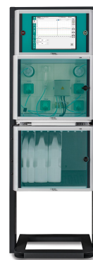
Figure 3. 2060 XRF Process Analyzer for the analysis of CTZ content in white bronze baths.

While XRF enables fast and accurate analysis of total metal content, voltammetry (VA) offers the added advantage of distinguishing free \text{Cu}^{2+} , \text{Zn}^{2+} , and \text{Sn}^{2+} ions, rather than measuring only their total concentrations. Distinguishing between these species is particularly important for monitoring the \text{Sn(II)}/\text{Sn(IV)} balance which is crucial for bath stability and plating performance. It also ensures that metal ion availability supports optimal deposition rates and bath efficiency.