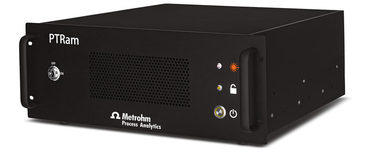
Figure 2. The PTRam Analyzer is suitable for quantitative inline process analysis.

operators to create a simple, yet indispensable calibration model used to produce quantitative results during the boric acid manufacturing process.