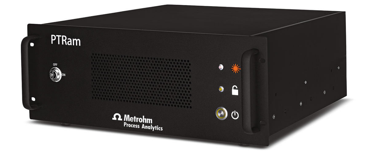
Figure 1. The PTRam Analyzer from Metrohm Process Analytics.

There is minimal space available to install an analysis system within the wet bench area ( Figure 2a ). Therefore, the PTRam Analyzer is the ideal solution for restricted spaces due to its small dimensions. Thanks to the embedded IMPACT software and the variety of industrial communication protocols, results can be