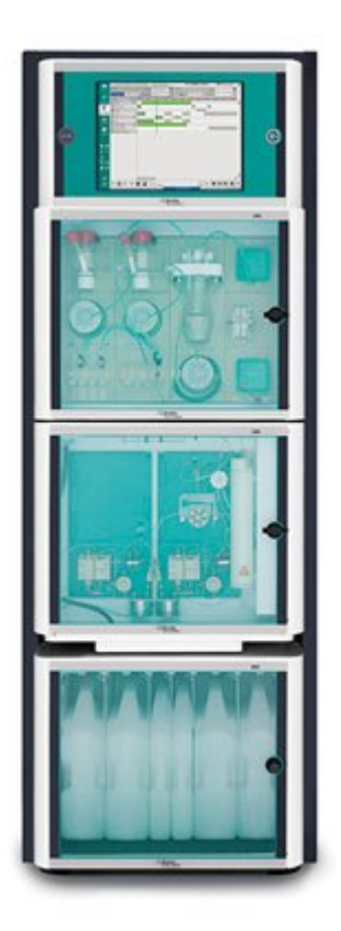
Figure 3. The 2060 IC Process Analyzer is available with either one or two measurement channels, along with integrated liquid handling modules and several automated sample preparation options.

The analysis is fully automatic. Lithium and other cationic component measurements are performed by non-suppressed cation IC followed by conductivity detection.