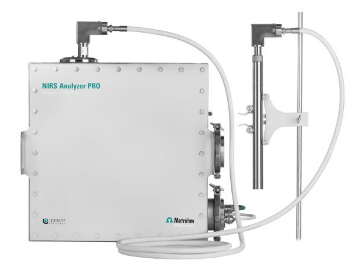
Figure 2. NIRS Analyzer PRO with fiber optic cable and probe.

The determination of the end of the drying process can be made when the moisture level asymptotically approaches a lower limit during the drying cycle. The operator is aided in making the decision to end the drying operation before the product is damaged or degraded. The delay caused by waiting for laboratory results before the product can be released for subsequent processing can be minimized or eliminated. Output from the NIRS Analyzer PRO ( Figure 2 ) can be used by the fluid bed dryer's programmable logic controller (PLC) or integrated into SIPAT (Siemens Industrial Process Analytical Technology) for closed loop process control decisions. The reduction in reprocessing steps saves both time and money, and improvement in the product quality can lead to even higher profits.