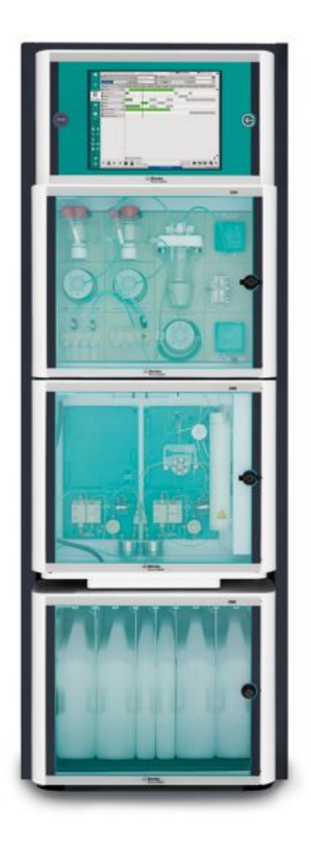
Figure 3. The 2060 IC Process Analyzer is available with either one or two measurement channels, along with integrated liquid handling modules and several automated sample preparation options.

These cations and more can be determined down to the sub-g/L range in a single analysis using ion chromatography. However, precise, reliable trace analysis requires the method to be automated as much as possible. Metrohm Process Analytics offers a complete solution for this