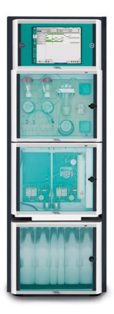
Figure 3. The 2060 IC Process Analyzer is available with either one or two measurement channels, along with integrated liquid handling modules and several automated sample preparation options.

Precise, reliable trace analysis requires the method to be automated as much as possible. Metrohm Process Analytics offers a complete solution for this task: the 2060 Ion Chromatograph (IC) Process Analyzer featuring combined Inline Preconcentration and Inline