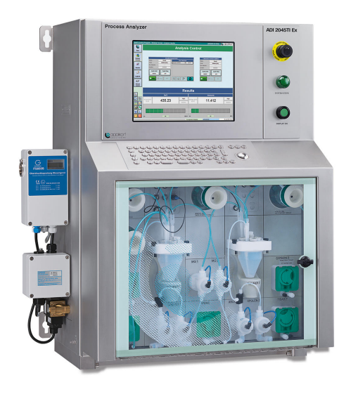
Figure 2. The 2045TI Ex proof Process Analyzer is certified for Zone 1 and Zone 2 areas.